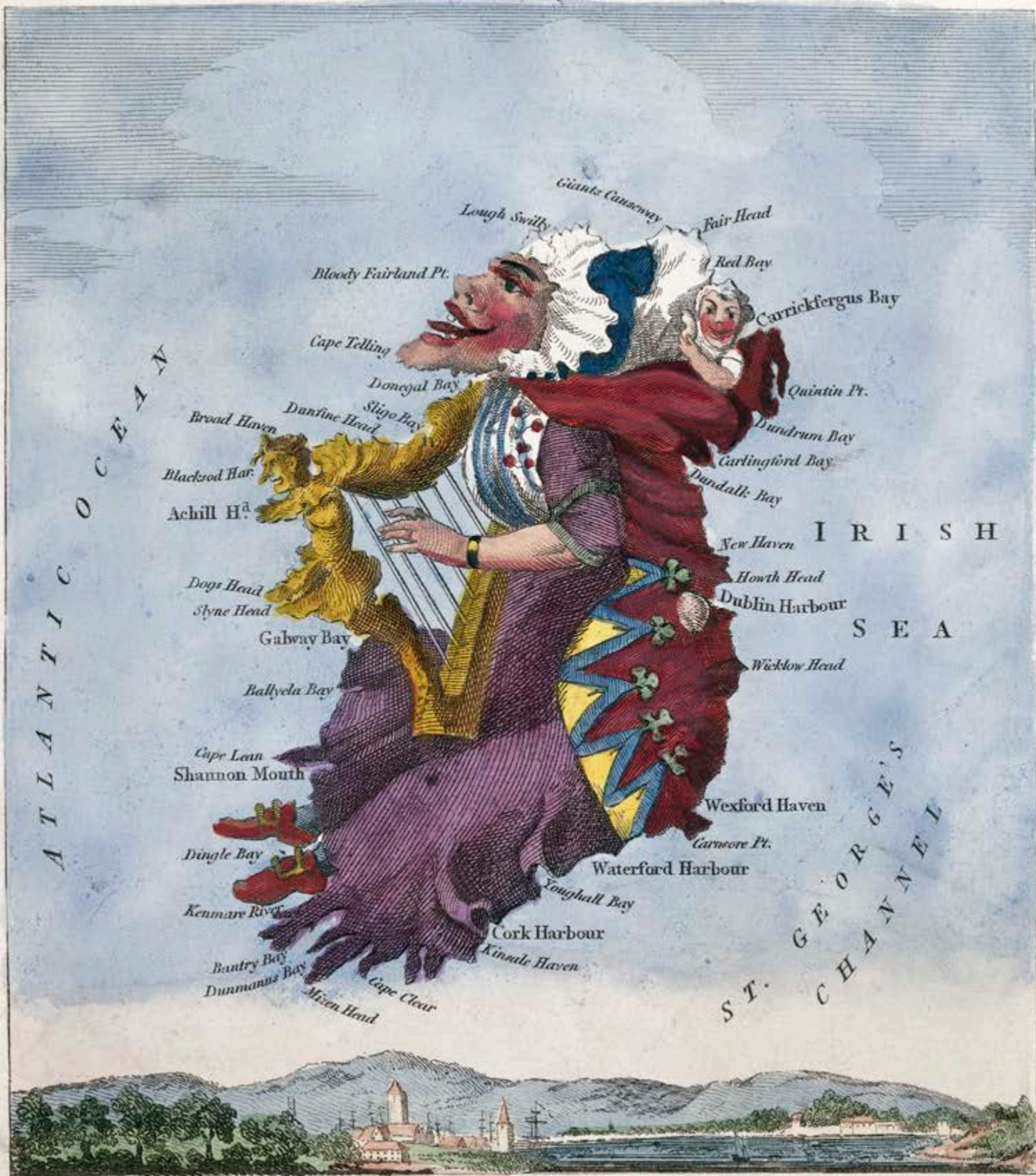
Geography Bewitched! or, a droll Caricature MAP of IRELAND. This Portrait of LADY HIBERNIA BULL is humbly dedicated to her Husband the great MR. JOHN BULL.