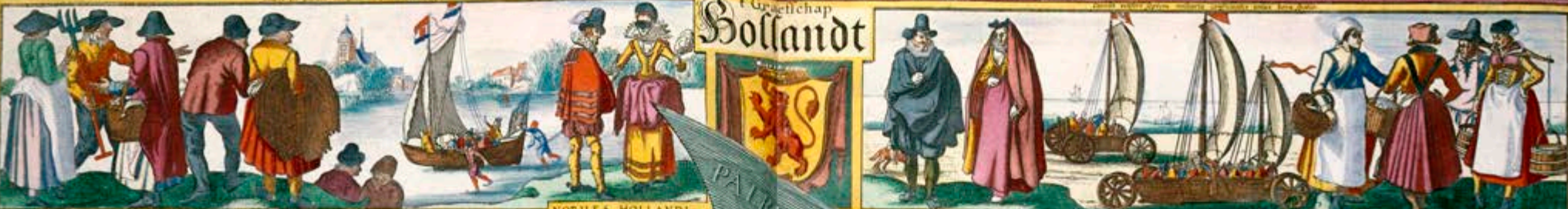
AGRICOLA HOLLANDIA AUSTRALIS