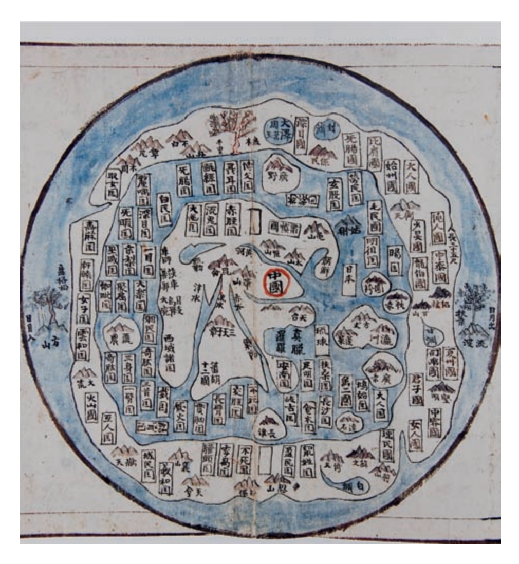
5.5 CHEONHADO MAP, c. 1700.

by Oh (2008), who draws together a number of strands. The first is that these maps firmly reflect the Sinocentric view of round sky, square earth. The circularity of the maps represents the heavens, not the earth. In many cheonhado maps, star constellations are shown outside the circular border, reinforcing the conclusion that the circularity represents the celestial. Look again at figure 5.5. Inside the circular heavens the squareness of the earth is more obvious. The second strand is that the maps draw on much older Chinese scholarship. The names on the map