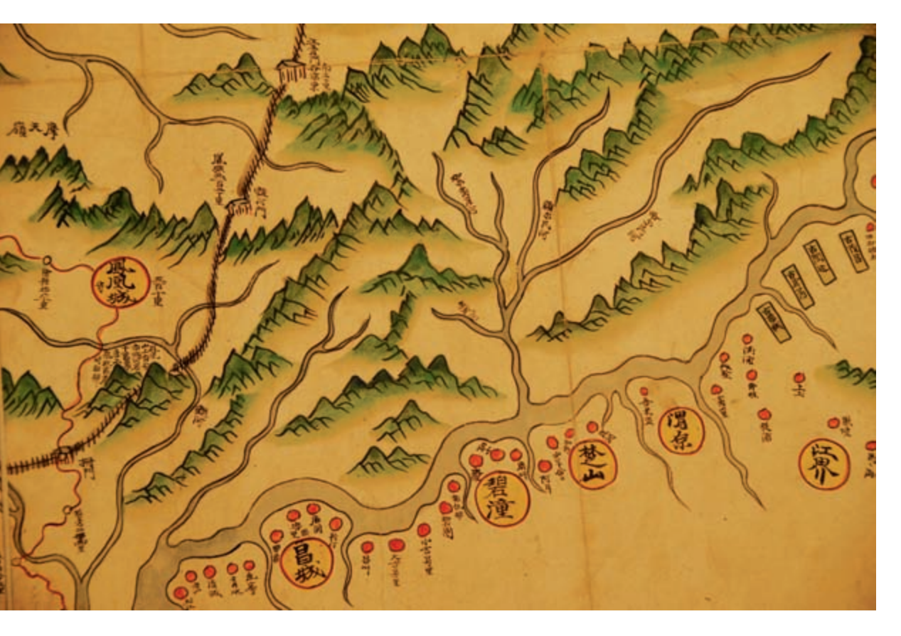
4.4 MANCHURIA, 1733–1858.

tinct sense of the containment of territorial expansion and the loss of an extended national space (Schmid 2002).