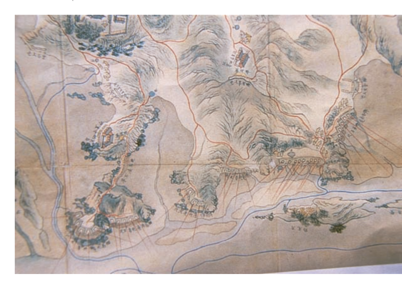
5.13 GANGWHA PROVINCE, 1870-80. (National Museum of Korea.)

Western power, then experienced subsequent attacks and defeats. Although I cannot be sure, I have a sense that these buildings and lines of fire were added to an existing map. They seem jammed in, not in scale with the rest of the map, as if they were put in later.