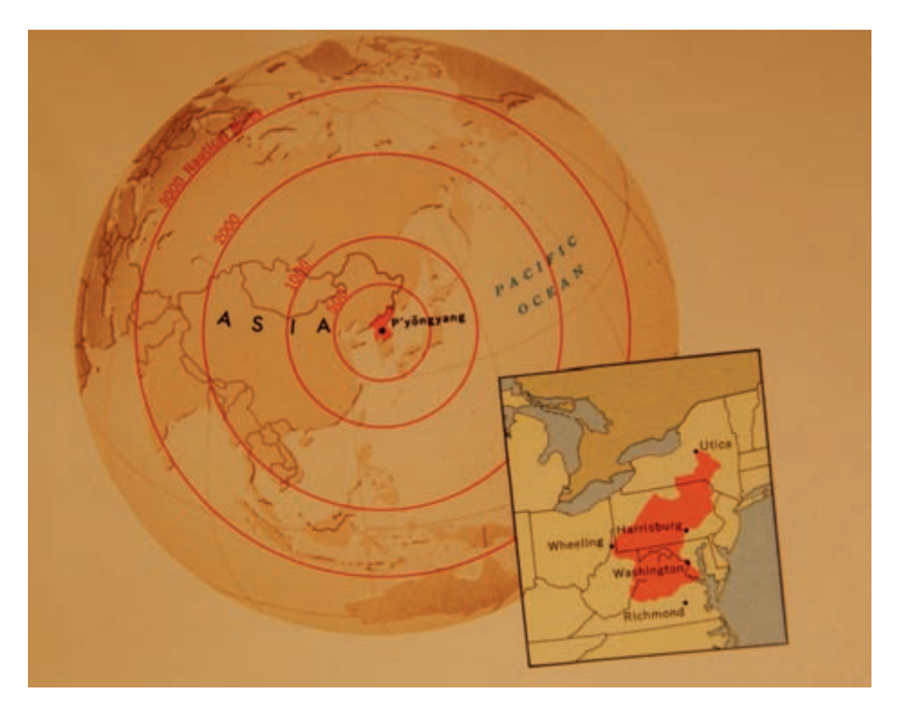
7.2 NORTH KOREA, CIA, 1969.

to decouple economic and military aid from explicit support for either side. While some of the North Korean domestic polices emulated those of China under Mao Tse-tung, the North Koreans maintained relations with both countries. The country's geographic position necessitated a pragmatic response of careful diplomacy reflecting the country's vulnerable political geography.