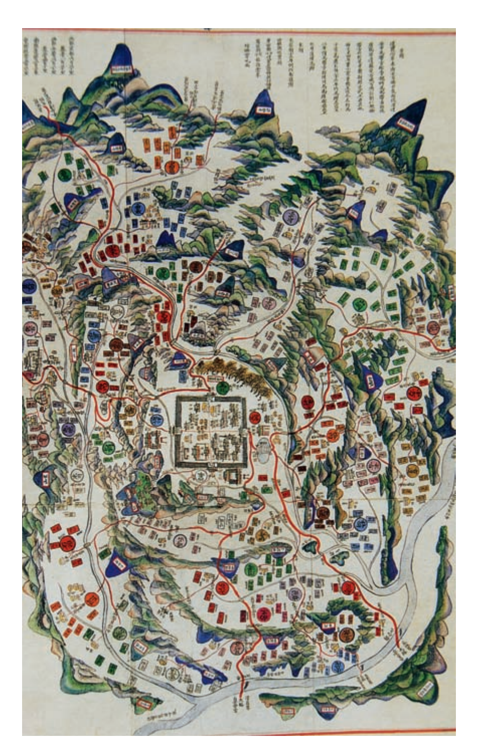
2.9 GWANGJU COUNTY, 1872.