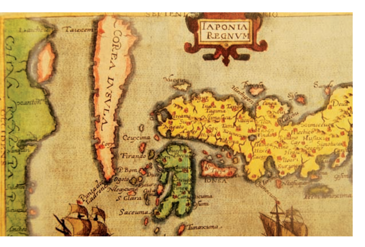
3.4 JAPAN AND KOREA, 1596. (Abraham Ortelius, Theatrum Orbis Terrarum [Antwerp: Plantiniana, 1596].)